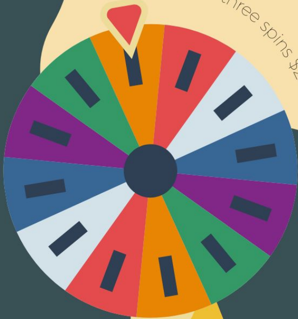
Wine Wheel of Fortune